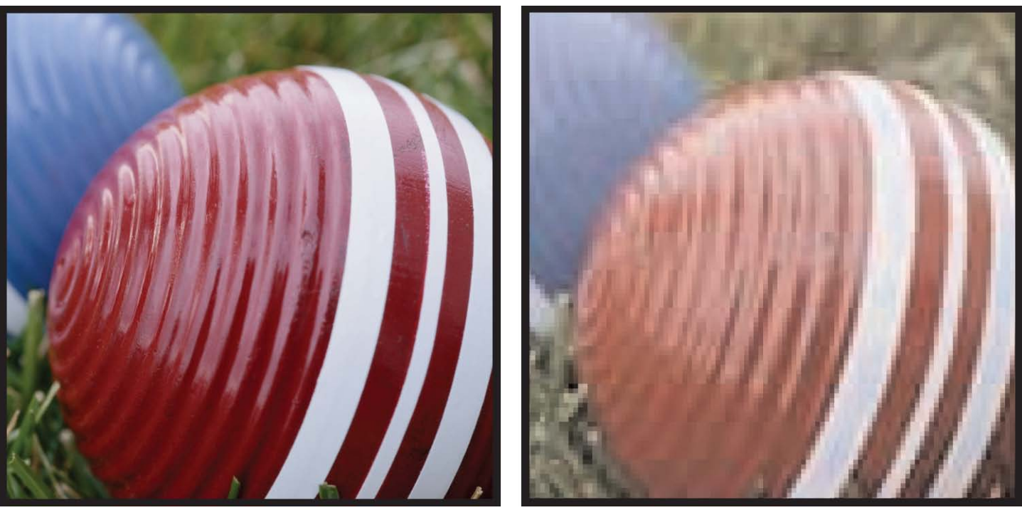
300 dpi TIFF file vs. 72 dpi JPEG file

• When a photo doesn't open automatically, you must choose a program to open the photo. Select Imaging. When the image opens, right-click it and select Properties, and then Resolution.