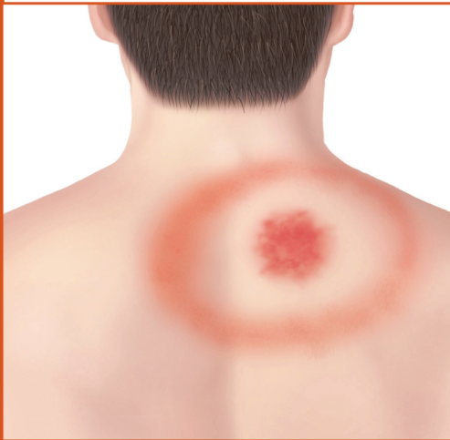
Bull's eye rash on the back.