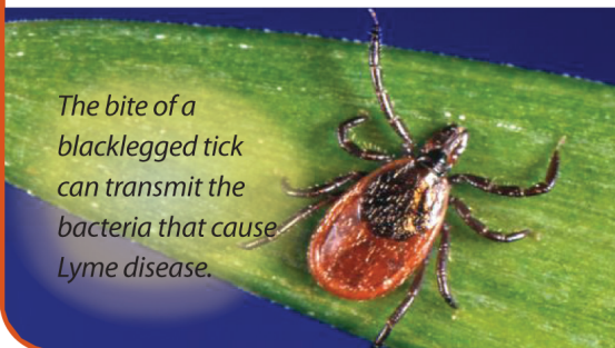
The bite of a blacklegged tick can transmit the bacteria that cause Lyme disease.